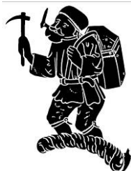
SOCIETY FOR POST-MEDIEVAL ARCHAEOLOGY