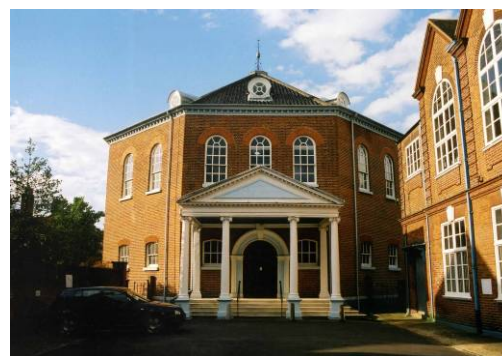
The Octagon Chapel, Colegate, Norwich

The conference venue is located in the heart of Norwich, a city with a long history of religious diversity, and many fine survivals of post-medieval religious architecture. The conference is timed to coincide with the Heritage Open Day weekend (11 th -14 th September), providing an unparalleled opportunity to explore many aspects of this unique heritage, including many churches, chapels and other religious buildings not usually open to the general public.